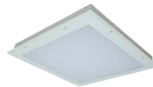
Cat. Ref. : KIPH 02 LED