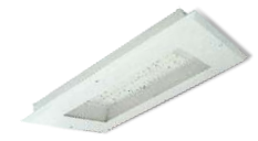
Cat. Ref. : KIPH 01 LED